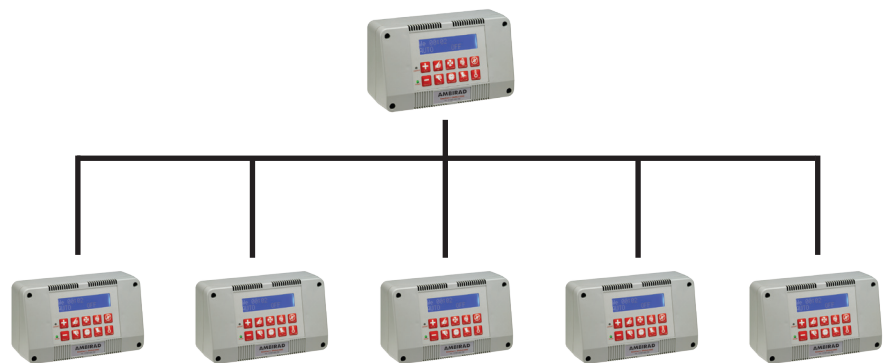
Optional SmartCom MZ panel allows up to 16 panels to be linked for centralised control