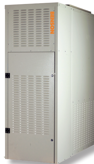
Vertical freestanding model

First year parts and labour, second year parts and ten year time related on combustion chamber.