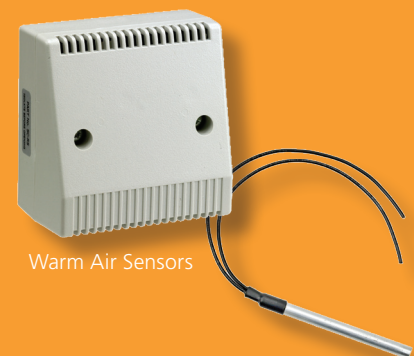
Warm Air Sensors

The sensor may be located in the return air duct (prior to any mixing with fresh air). Alternatively for make-up air applications requiring a constant supply air temperature the duct sensor may be located in the supply duct to control high/low or modulating burners (SmartCom 3 MZ control only).